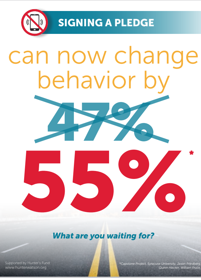
Students signing Hunter's Pledge report 55% change in driving behavior.