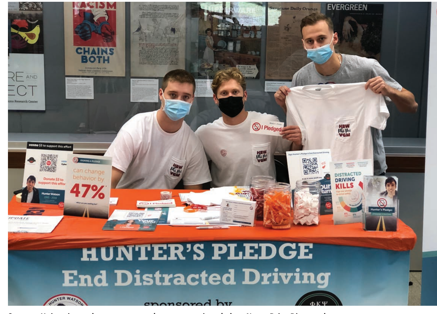
Syracuse University students encourage classmates to sign pledges Not to Drive Distracted.

Campus organization sets record-breaking Safe Driving Week